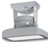
Radar Level Sensor