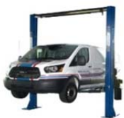
Two Post Lift