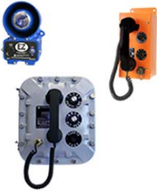
Paging & Intercom