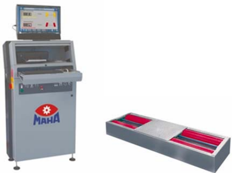
Roller Brake Tester