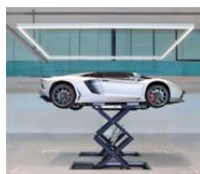
Twin Scissor Lift