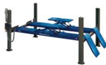
Four Post Lift