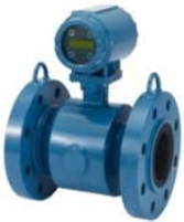
Magnetic Flowmeter Flowmeter