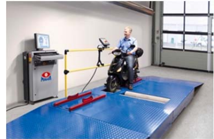
Motorcycle Test Lane