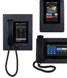
HUBBCOM™ IP Devices