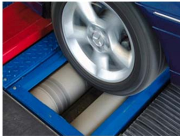
Speedo Meter Tester