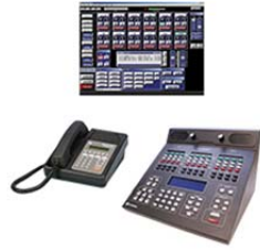
Radio Dispatch Products