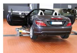
Two Cylinder Lift